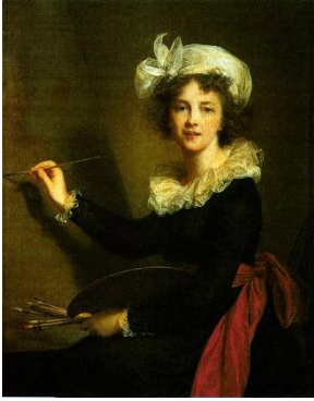
Self-Portrait by Elisabeth Vigée Le Brun (1755-1842)