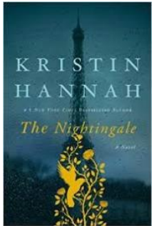
The Nightingale by Kristin Hannah

We will meet on Tuesday, March 15 , again at Crest Pier Community Center, 5800 Ocean Avenue, Wildwood Crest (between Crocus & Heather) at noon. Please bring your lunch and a beverage.