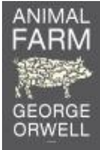
Animal Farm by George Orwell

Note: Since the evening book group is no longer a potluck literature club, we have dropped that name.