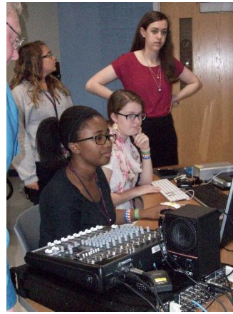
Girls work in ACCC's TV studio as part of a workshop called "You Should Be On TV"

AAUW is a national organization whose primary mission is education for women and girls.