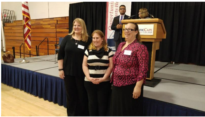
Above is a picture of the Cape May AAUW scholarship students from the Scholarship Recognition Ceremony on May 17 at Atlantic Cape Community College in Mays Landing.