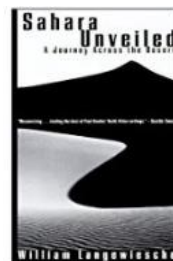
Sahara Unveiled, A Journey Across the Desert by William Langewiesche

We will meet on Wednesday, January 24 at 6 pm at a restaurant to be announced later. Mulligan's is closed for the winter. A separate email will be sent out with the chosen location. We will discuss the book after ordering dinner.