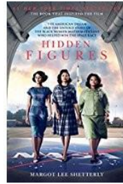
Hidden Figures by Margot Lee Shetterly

We will meet on Tuesday, January 16 at 12 noon at Crest Pier Community Center, 5800 Ocean Avenue, Wildwood Crest (between Crocus & Heather). Please bring your lunch & beverage. Dessert will be provided.