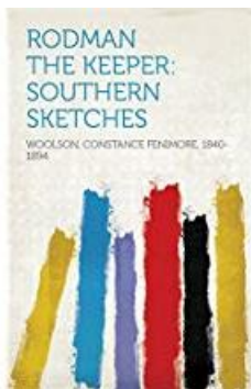
Rodman The Keeper: Southern Sketches by Constance Fenimore Woolson

The Evening Book Group will not meet in December. We will resume meeting in January.