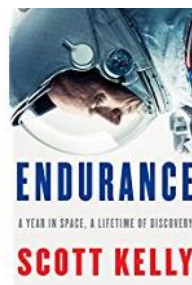
Endurance by Scott Kelly

We will meet on Wednesday, January 23 at 6 pm at Rio Station located at the corner of Route 9 and Route 47 in Rio Grande. We will discuss the book after ordering dinner.