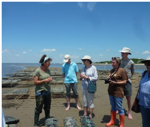
Learning how to grow oysters