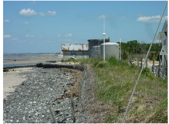
Shack which was the original research facility