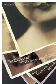
Marjorie Morningstar by Herman Wouk

We will meet on Tuesday, October 15 at 12 noon at Crest Pier Community Center, 5800 Ocean Avenue, Wildwood Crest (between Crocus & Heather). Please bring your lunch & beverage. Dessert will be provided.