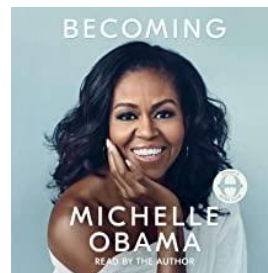
Becoming by Michelle Obama

We will meet on Wednesday, February 26 at 6 pm at Mulligan's Shore Bar & Grill, 310 West Hildreth Avenue, Wildwood.