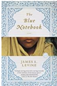
The Blue Notebook by James Levine