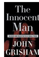
The Innocent Man by John Grisham