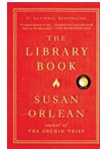
The Library Book by Susan Orlean