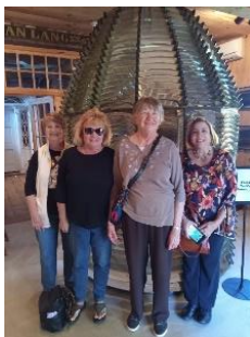
Trip to the Cape May County Historic Society