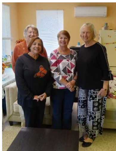
Board meeting attendees.