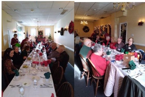
Holiday Luncheon at The Tuckahoe Inn