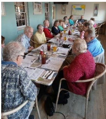
Full house at Mulligans for book group