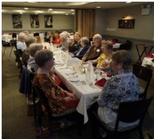
Welcome Back Dinner at Alfe's.