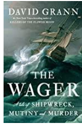
The Wager by David Grann

We will meet on Wednesday, December 27 at 6 pm at Mulligan's Shore Bar & Grill, 310 West Hildreth Avenue, Wildwood. We will discuss the book after ordering dinner.